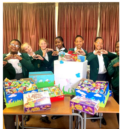
Easter Eggs Donations

Our Lasallian children donated Easter eggs to the school, which the Young Lasallians proudly distributed to various charities.