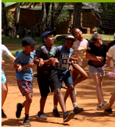
Holy Cross Junior Camp

help us to enter in our inner world and ask ourselves where am I? What Spirit is inside me? A good Spirit or Evil Spirit? Dear Brothers and Lasallians, on one hand if we feel we have the good spirit - we will be able to resurrect with Jesus Christ.; on the other hand, if we feel we have the evil spirit this is the time to repent and bow down, and bend our knees, and kneel before the Lord Jesus who is going to forgive us.