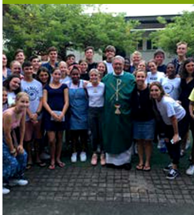
Holy Cross College