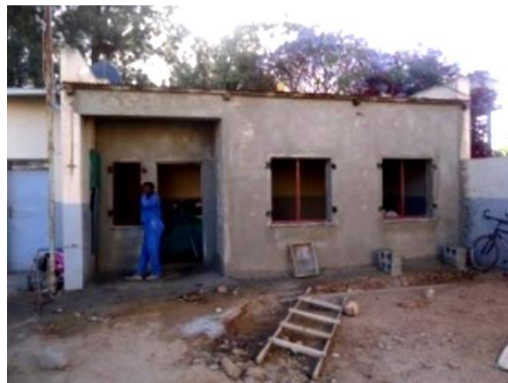
The new sector office

After the Nationalization of “Collegio La Salle”, the school owned by the Brothers in Asmara, the Sector remained without a property and an office serving the center. The Sector still has unsolved issues related to the center. To minimize on the expenses