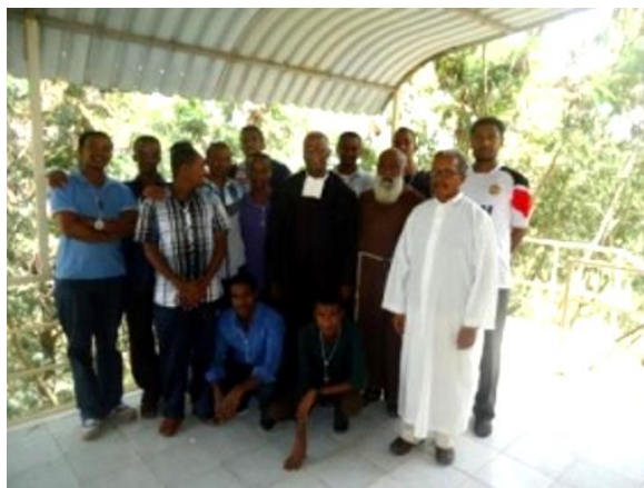
Brothers in Filfil Recollection

The annual Recollection of the Scholasticate and Postulancy together took place in a special and natural place called Filfil Selemuna. It was refreshing and inspiring not only because of the unique geographical nature of the place, but also because of the great animator Father Tedros from the Capuchin order. On that day, almost all Brothers of Asmara community and our four Postulants enjoyed the goodness of the Lord