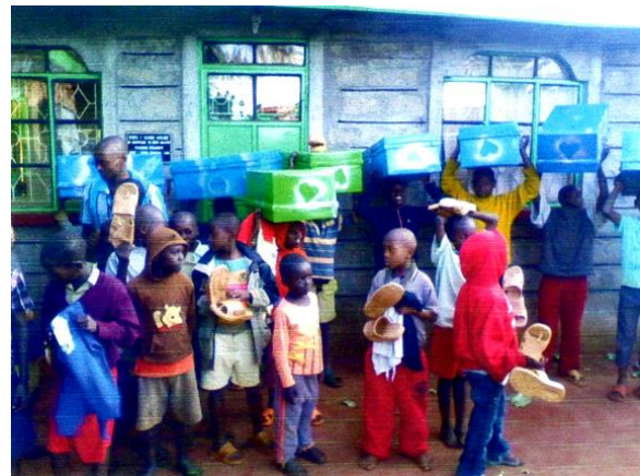
Some Juniors of St. Mary's Nyeri

A visit to the Brothers' communities and schools revealed that the 2nd Year novices on apostolate / community experience are intensely immersed in the activities of the schools where they are assigned. The Brothers in the communities have affirmed that the exposure the novices are having is deepening their desire for the charisma and spirituality of our Institute. The novices in Nyeri Community voluntarily donated part of their stipend as Lenten project, in other to assist the less privileged boys they work with. This wave of thoughtfulness inspired