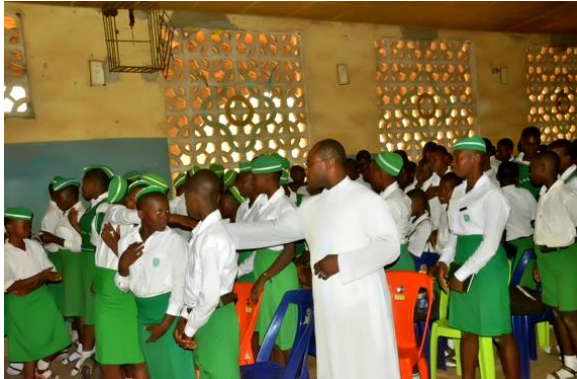
Staff and Students share the sign of Peace at the Term's Opening Mass

to humanity through St John Baptist De La Salle. As such he urged all present at the mass to show appreciation to God by conducting the second term's school affairs with full commitment and diligence.