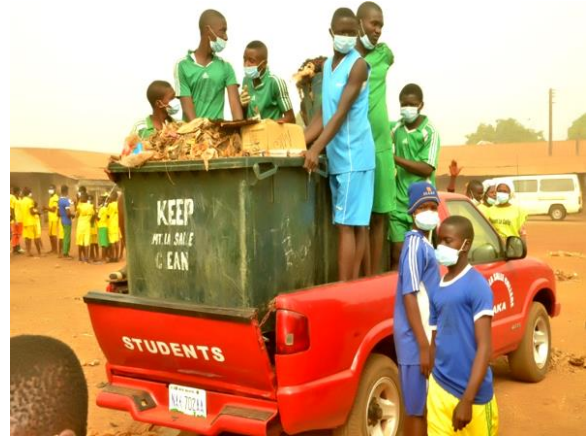
Students and Teachers actively carryout Community Service