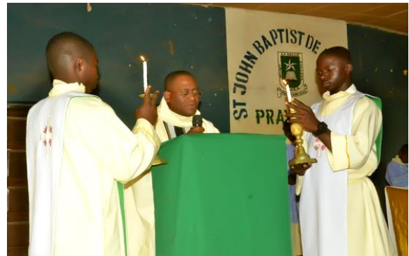
The Priest reads the Gospel at the Term's Opening Mass