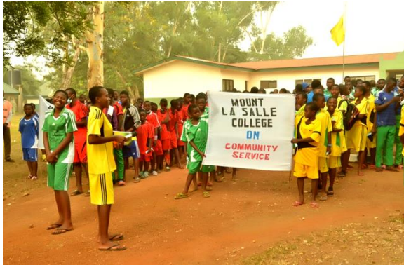
Students set out to carry out community service for Naka Town

In the bid to promote humility, community service and cleanliness, Mount La Salle College Naka in December embarked on a service that led them to clean up Naka town.